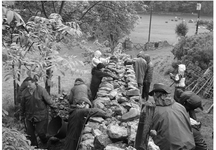
a Society at Pensychnant