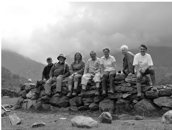
inished wall makes a good seat!