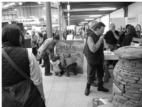
w at RWAS Spring Festival